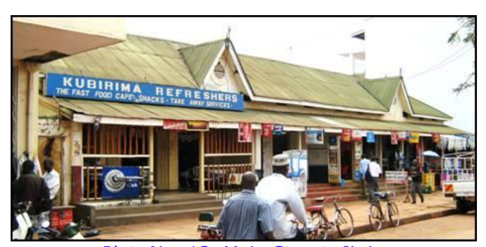
Plot. No. 13, Main Street, Jinja