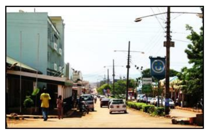
Streetscape of Jinja Main Street: A view from intersection of Bell Ave. West and the Main St.

Ensuing photos below represent mostly what ICOMOS describes as the East African shared colonial architecture.