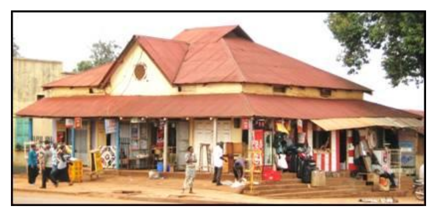
Plot No. 84, Main Street, Jinja, 1928.