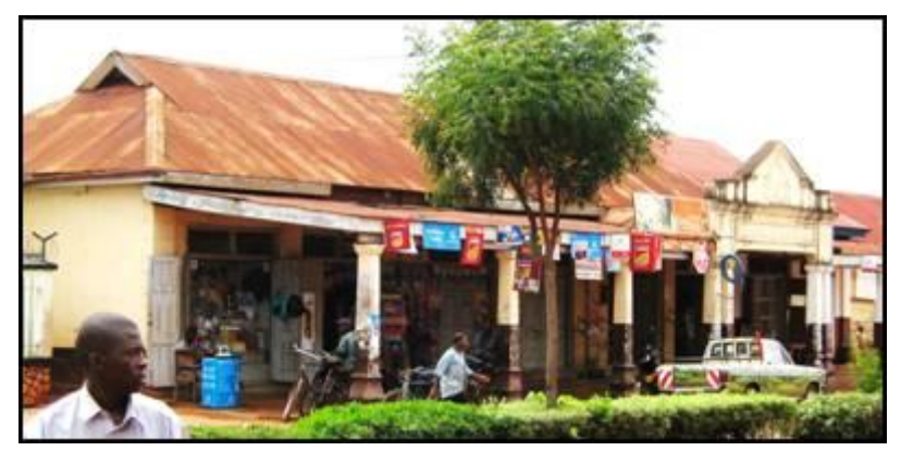
Plot. No. 19, Main Street: Pitamba Motibhai Building, 1932.