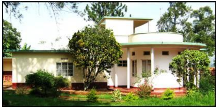
Plot No. 46, Kiira Rd.