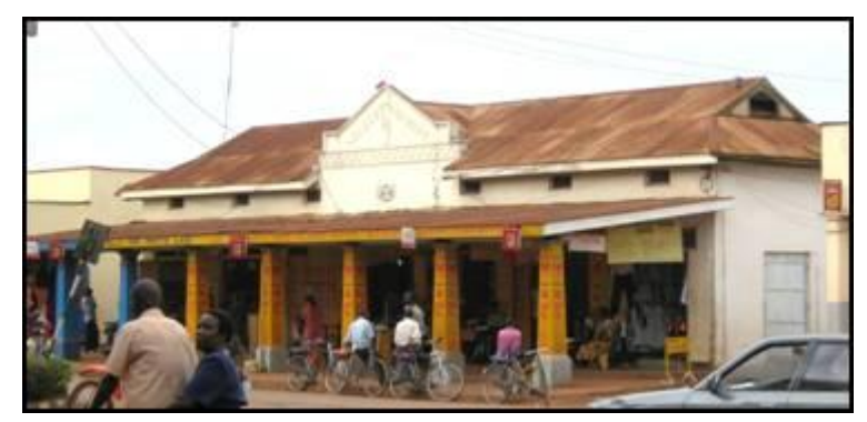
Plot No. 64, Main Street: Venezes Building 1937.