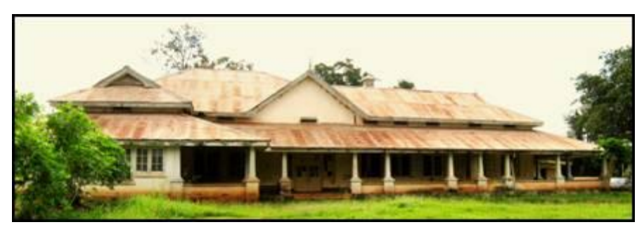
What used to be the Governor's residence in colonial times on Circular Rd., Jinja.