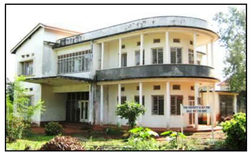
Plot No. 47, Kiira Rd., Jinja.