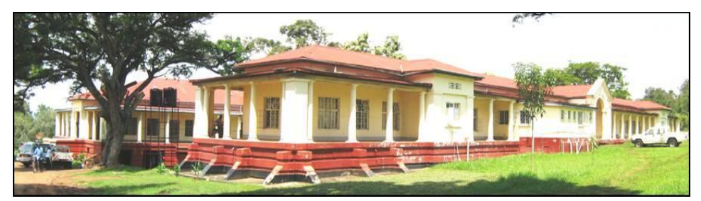
Central administrative offices of Jinja District, a view from the North West.