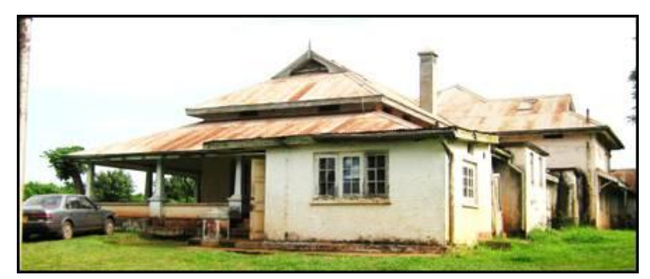
View from the West