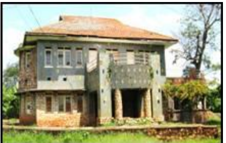
Plot No. 14, Grant Rd.