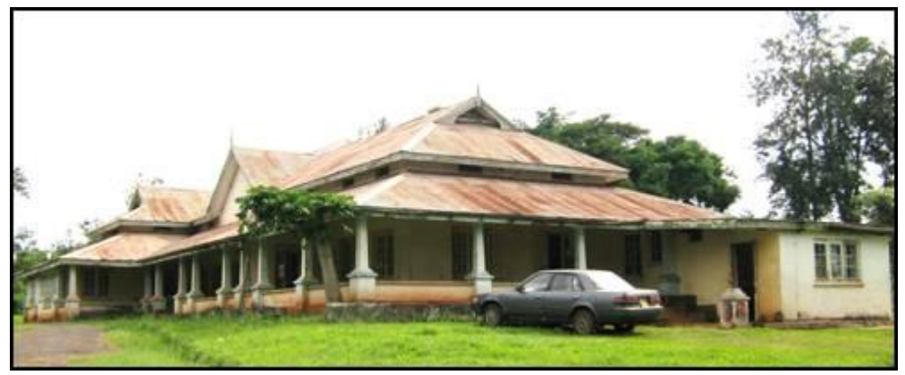
View from the North